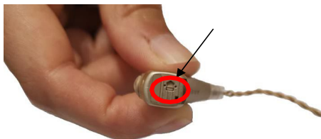
Battery door unlocked

To unlock the battery door: use the same tool to move the sliding bar at the bottom of the hearing aid down in the unlocked position, as shown in the picture below.