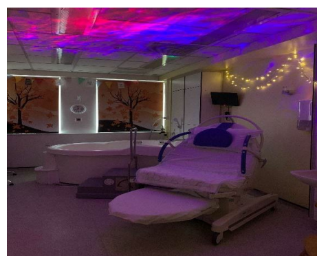
Rushey Birth Centre room