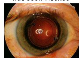
Eye after the permanent implant /intra ocular lens has been inserted