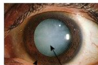
Iris Cataract behind the pupil