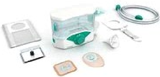
Colostomy irrigation (Braun 2019)