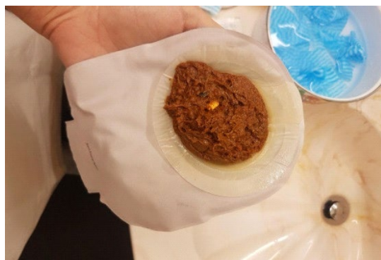
Pancaking on back of pouch (The Spoonie mummy 2020)