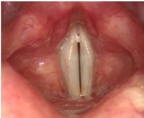
A healthy larynx